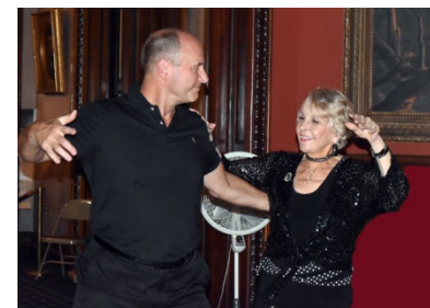
Swing dancing in the Historic Rotunda