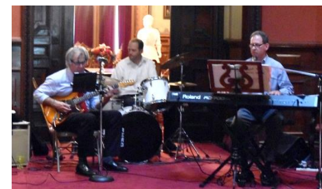
The Investmark Jazz Trio

For more information, please visit the LMMM website at www.lockwoodmathewsmansion.com